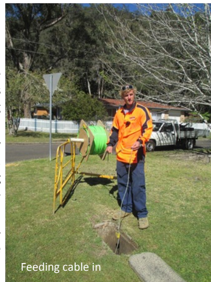
Feeding cable in

Gradually all components will be in place for home connections.