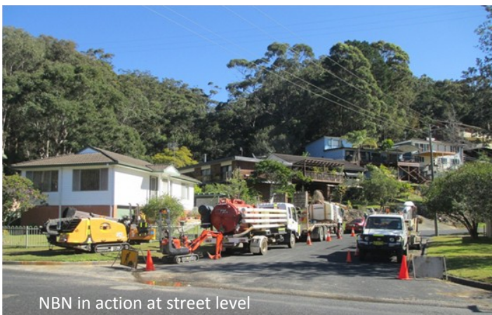
NBN in action at street level

Lucy explained that the "mixed technology" option is being trialled